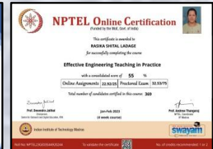
Swayam/ NPTEL done by department Faculty