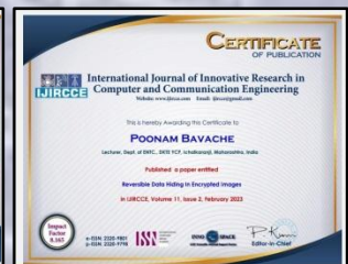
Paper published by department Faculty